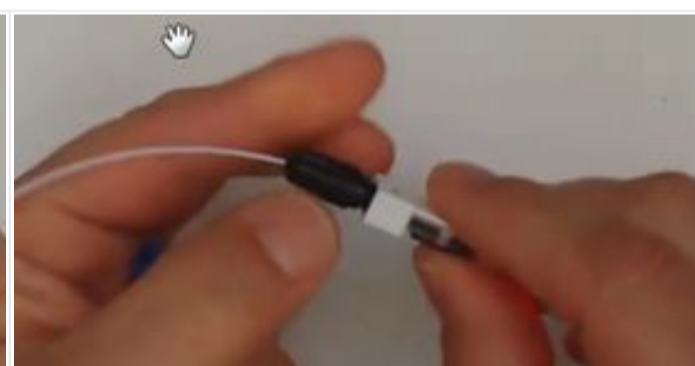
Slide boot up and then screw cap. Place cover over