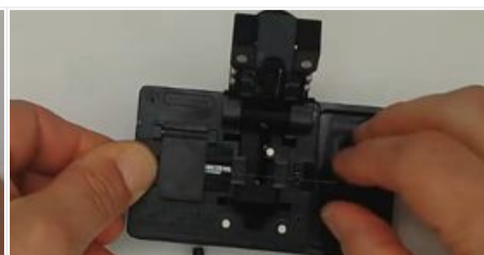
Using fiber cleaver, cut fiber to 12.5mm