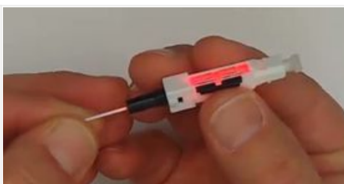
When light appears through end face, press button down