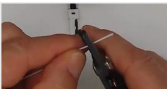
Strip approx. 50mm. Primary coating must be removed